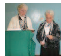
The two Honoras.