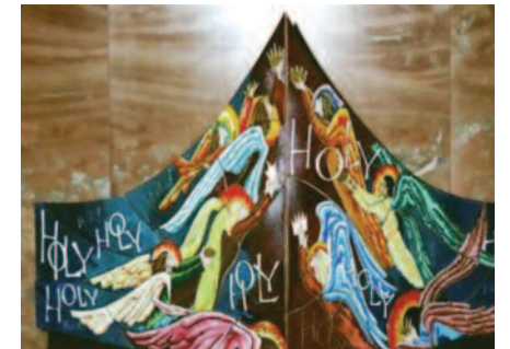
Tabernacle in St. Catherine Chapel.