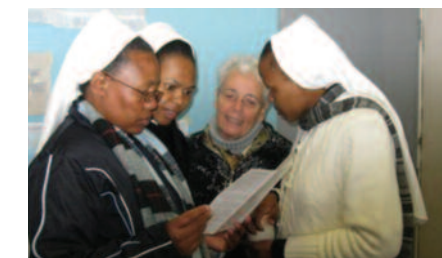
Sisters confer about the tomb of St. Dominic, Bologna.