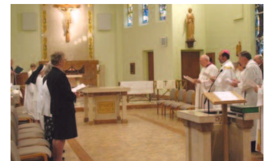
St. Catherine Chapel dedication.