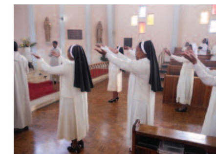
Presentation of gifts at Sunday Eucharist, Chapel, Montebello Motherhouse.

noted how often Dominican sisters and brothers through the centuries found creation to be a true revelation of God.