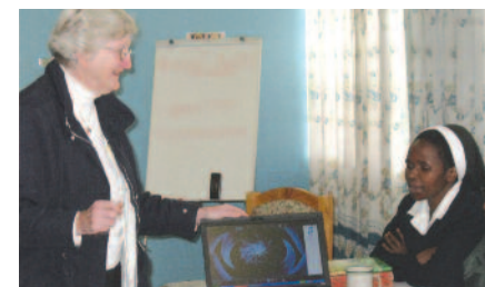
Listening to playback of singing during morning prayer.

The sisters met 6 days a week to reflect on Dominican Spirituality, to experience the Universe Story, and to learn some basic preaching skills. Each day they viewed a segment of the DVD, A Journey with Dominic and the Order of Preachers and discussed its application to our lives. Topics included Saints