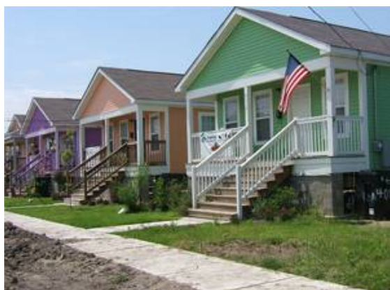
Musicians' Village Rebuilt homes in New Orleans Spring 2008