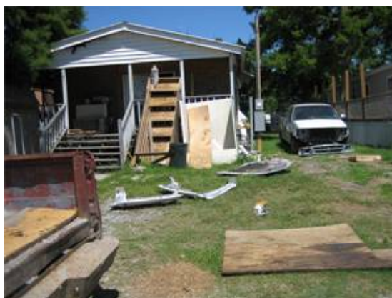
One of thousands of homes still abandoned in New Orleans Spring 2008